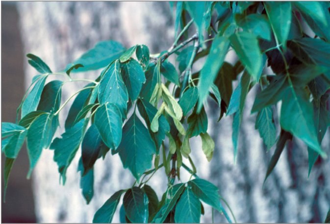
Figure 3. Boxelder tree

interior from overwintering areas within the home, e.g in walls or attics. As they wake up, they follow the warmth into the home's living quarters. Once there, they typically move towards windows and other sunny areas. However, the warmth does not reach the insects equally and they do not all become active at the same time.