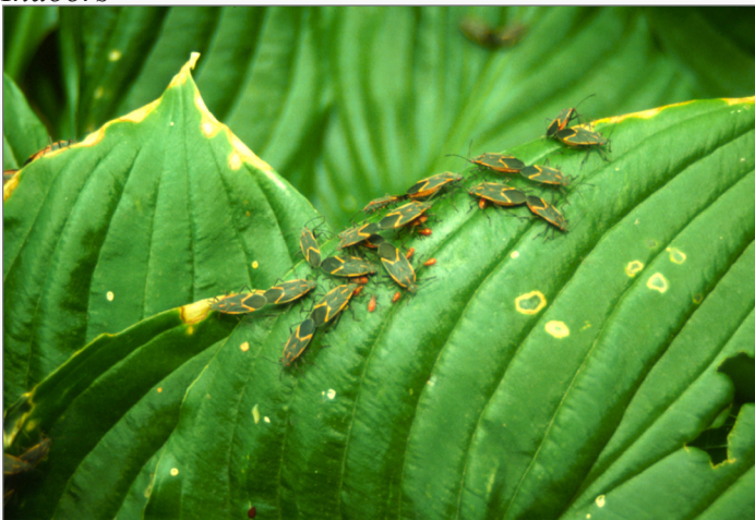
Figure 4. Boxelder bugs on hosta (they do not injure plants).

Once boxelder bugs are found the best option is to physically remove them with a vacuum or a broom and dust pan. If this occurs during fall, check around the building exterior because they can often be found congregating in sunny or warm areas. If they are close to entrances, an insecticide may be required to prevent their entrance into a home.